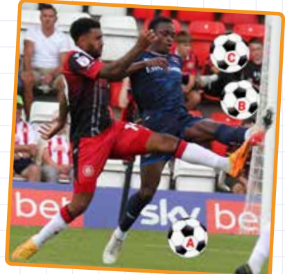
CAN YOU TELL WHERE THE BALL IS IN THIS PICTURE?