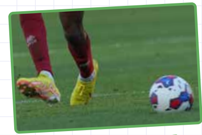
WHO DO THESE BOOTS BELONG TO?